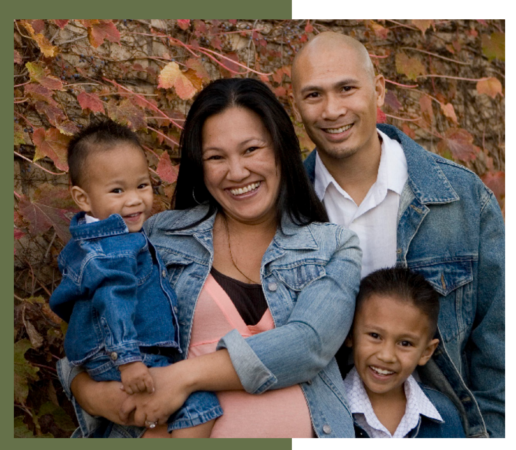
Author: Eileen Gale Kugler